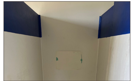
Exhibitor Changing Rooms

Grading, Install Weed Barrier, 210 Tons of Rock Dust for 8,400 SF, Compacting