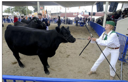
Beef Ring Improvements

Pressure Wash Inside/Outside and Paint the Front