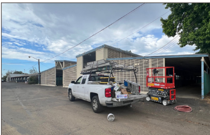
N. Swine Barn

Pressure Wash Inside/Outside and Paint the Front