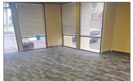
Old Board Room

New Tires for Poultry Express Train and Shaded Area for Small Stock Show