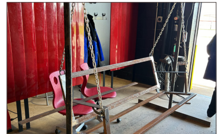
Industrial Arts Scholarship

$3,500: Split Between “Runners Up” for the 2024 Scholarship Animal Project