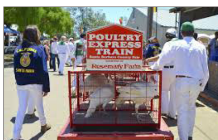
Poultry Express Train

New Stalls, Paint, and Upgrade Fixtures in Men’s and Women’s Restrooms